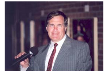
Keynote Speaker, Bill Belichick

A wonderful time was had by all who attended, and the BPLA extends its gratitude to everyone who contributed to making the evening such a great success.